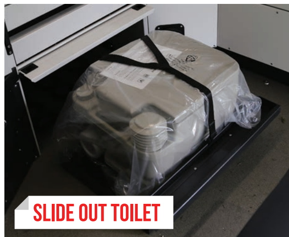
SLIDE OUT TOILET