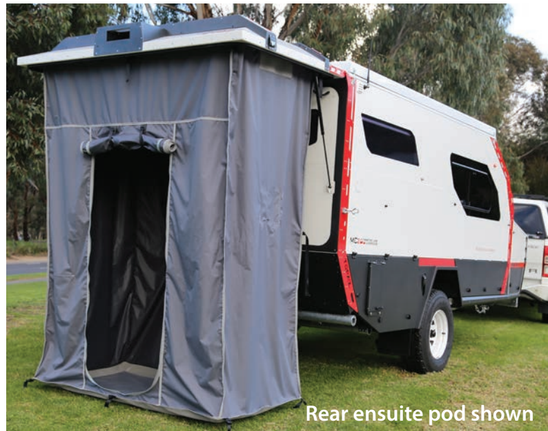
Rear ensuite pod shown

The rear ensuite pod is lighting fast and sets up in less than a minute! The ensuite tent is stored within the pod and is easily lowered to create a private space for your shower. It features a built-in floor with mesh sides allowing water to disperse easily. The pod features an integrated LED light, sturdy sheet metal construction and stylish rear LED tail lights.