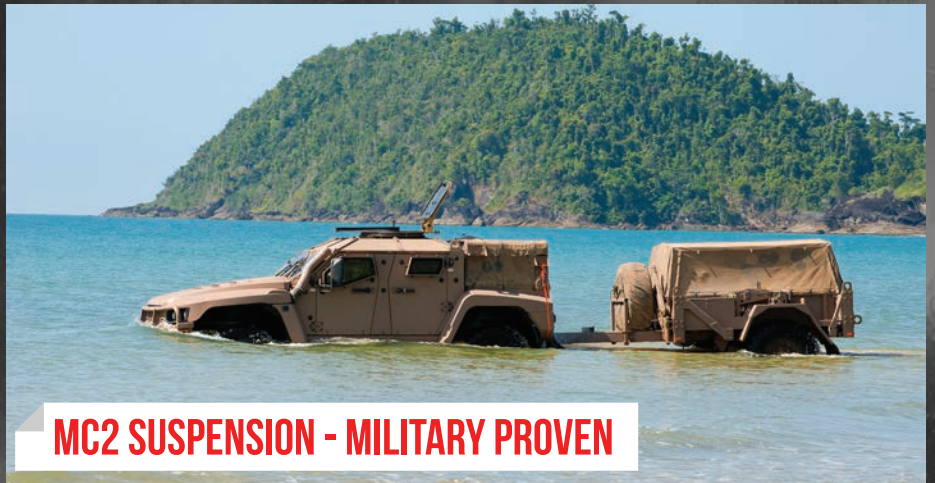
MC2 SUSPENSION - MILITARY PROVEN