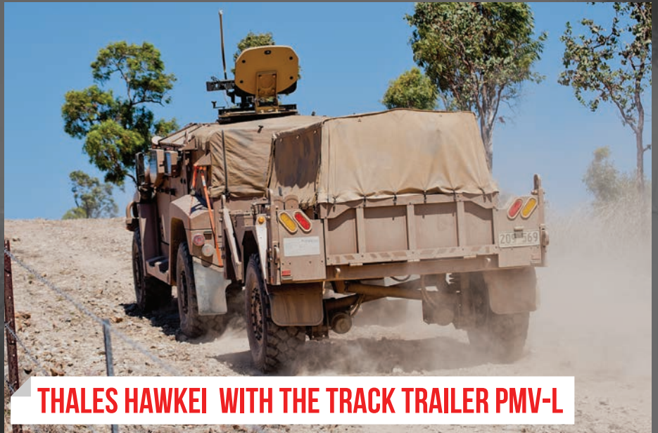
THALES HAWKEI WITH THE TRACK TRAILER PMV-L