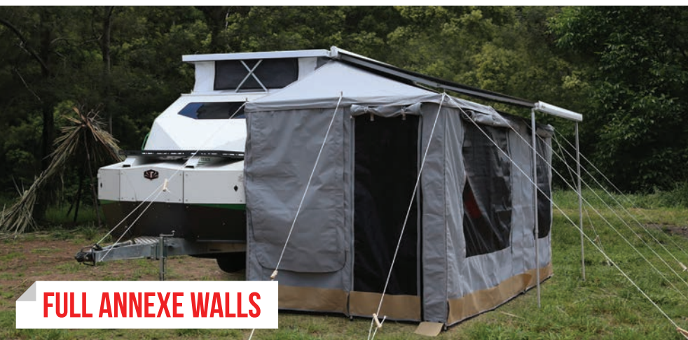
FULL ANNEXE WALLS