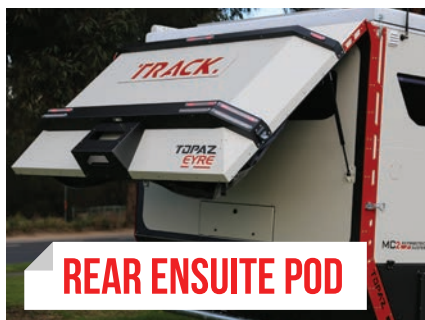
REAR ENSUITE POD